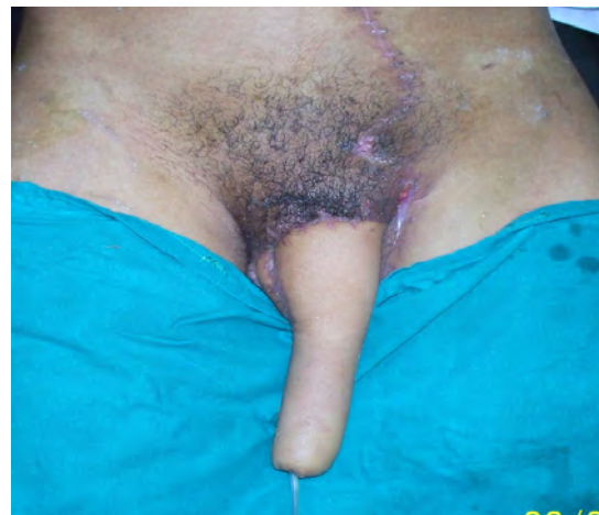
Figure (4): Case 8 (preoperatively and 2 weeks postoperatively).