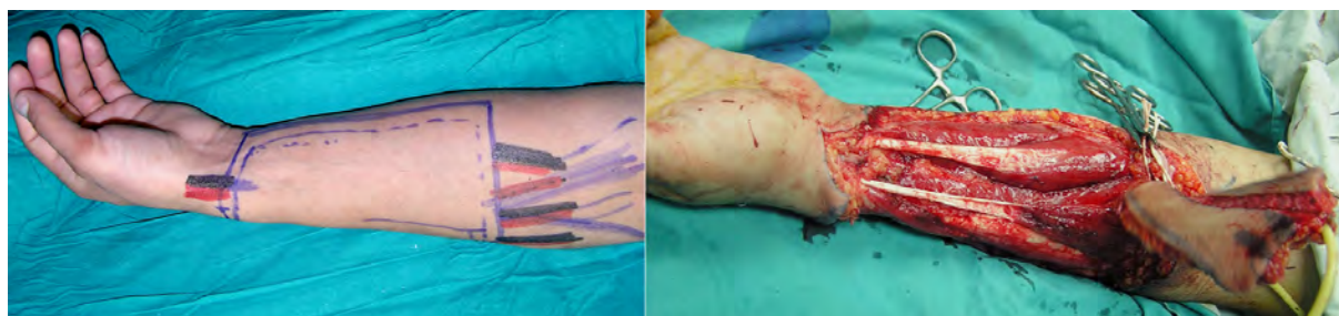
A) Flap design and elevation.

* Remnant phallic skin, ** Radial forearm flap (neophallus).