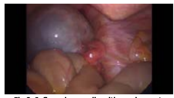
Fig 2: Inflamed appendix with ovarian cyst.