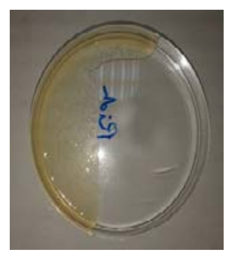
Fig 2: The gel form of PRP in the petri dish.

5. The ulcer was exposed to proper debridement for any necrotic tissue and irrigated by saline till it became clean and ready to receive the gel layer of PRP.