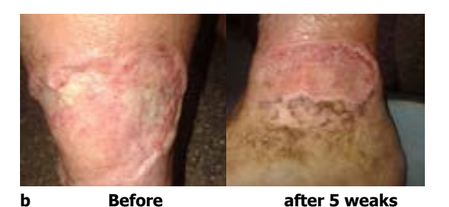
Fig 6: Two patients from group (A) with > 50% improvement in the size of the ulcer after 4 weeks in (a), and after 5 weeks in (b).