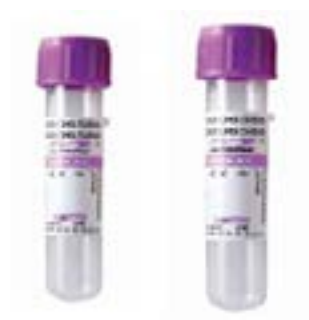
Fig 1: Ethylene Diamine Tetraacetic Acid (EDETA) tubes.