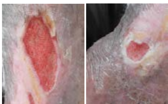
a Before after 4 weeks

In this table we noticed that the percentage of change in formula of an ellipse of the ulcer after the end of treatment showed highly statistically significant difference between cases and controls with P value < 0.01 adding more evidence to treatment efficacy of PRP when compared with the traditional methods.