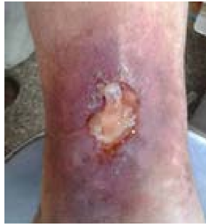
Fig 3: The PRP gel applied on the ulcer.