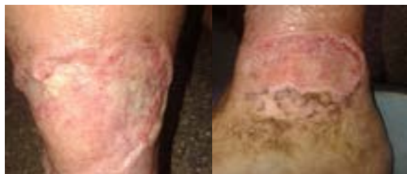
b Before after 5 weeks