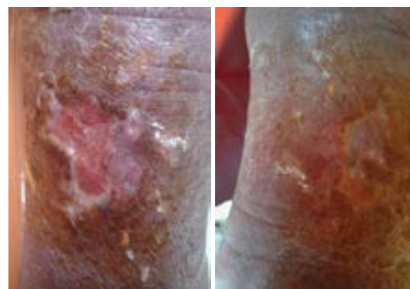
b Before after