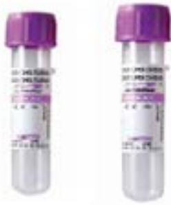
Fig 1: Ethylene Diamine Tetraacetic Acid (EDTA) tubes.