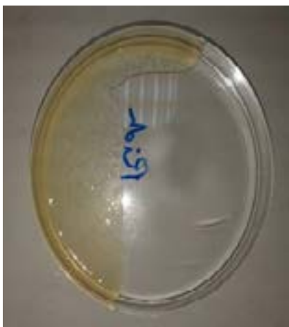
Fig 2: The gel form of PRP in the petri dish.