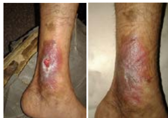
a Before after