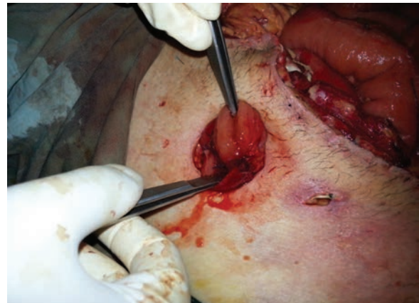
Figure (1): This is a case of leakage after intestinal resection due to penetrating abdominal trauma. The lower two photos are showing end-loop stoma before and after anastomosing the posterior walls of intestinal loops cut ends.

the other 6 cases dissection of both stomas with the removal of skin bridge in between was the technique to restore the intestinal continuity.