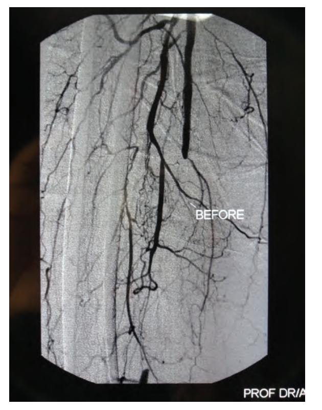
Figure (1): Superfacial femoral artery.