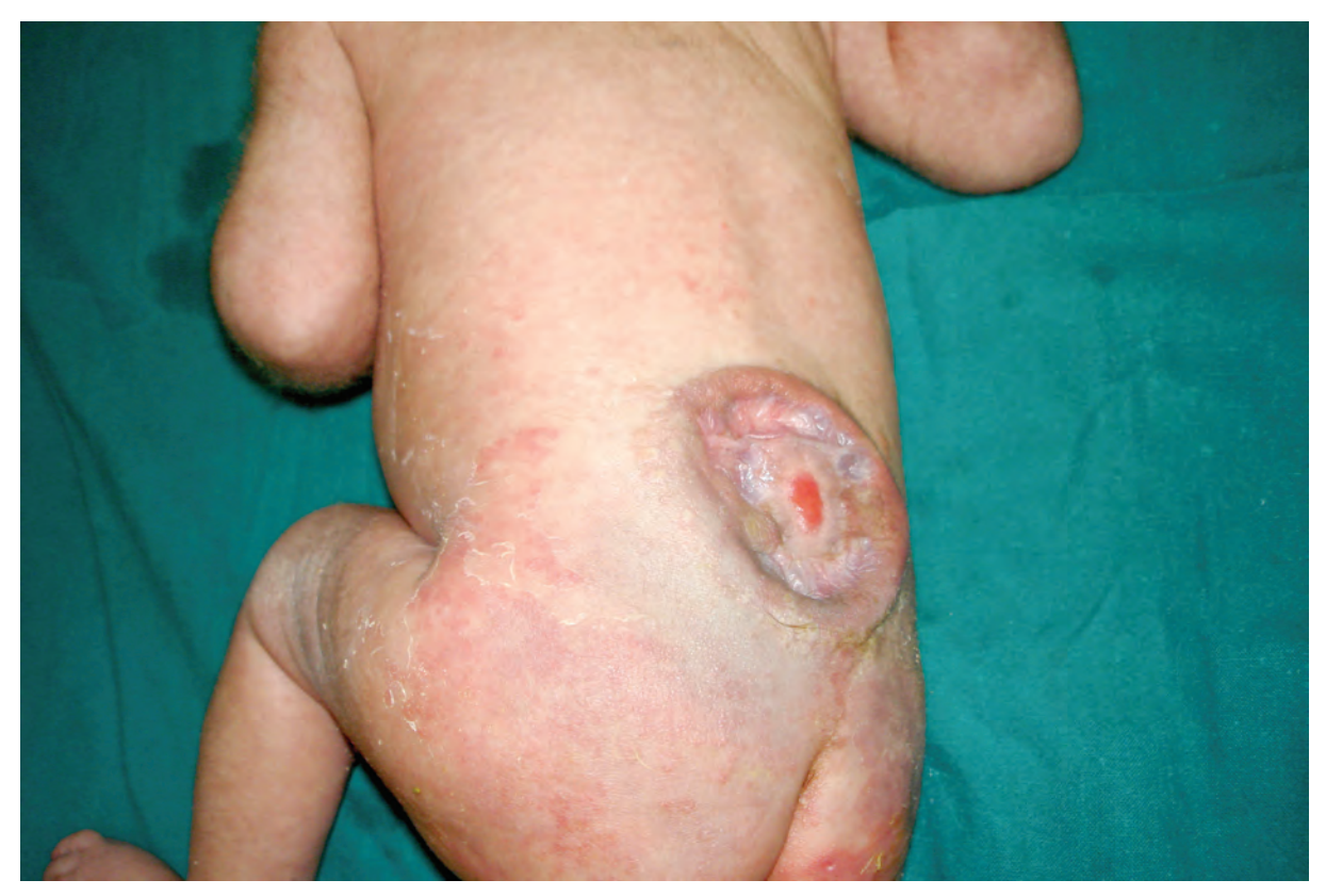
Figure (1): Preoperative.