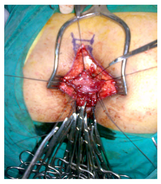
Figure (4A): Anastomosis of the proximal rectum to distal part.

The mean distance between the distal incision margin and the inferior border of the tumor was 1.8cm (range 1.9cm to 2.7 cm). No evidence of residual tumor cells was present in the distal or proximal incision margins. According to TNM classification, 11(52.8%)