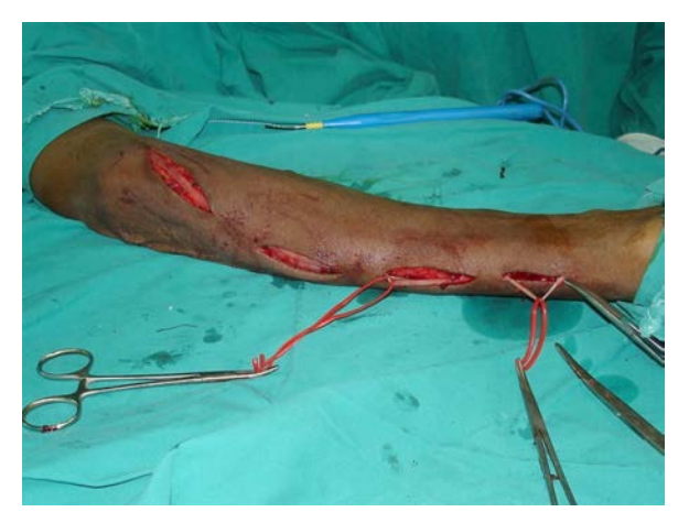
Figure (2): Dissection of the basilic vein and lgation of the tributaries through multiple separate incisions.