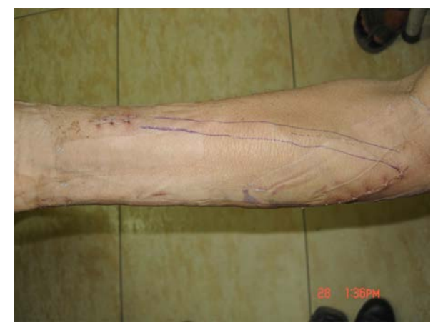
Figure (6): Early postoperative after transposition of the basilic vein and closure of the skin with prolene suture.