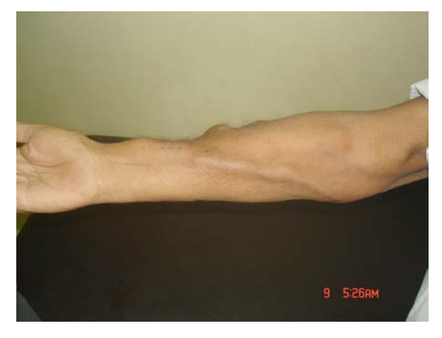
Figure (7): One month post operative with mature basilic vein in RBAVF.