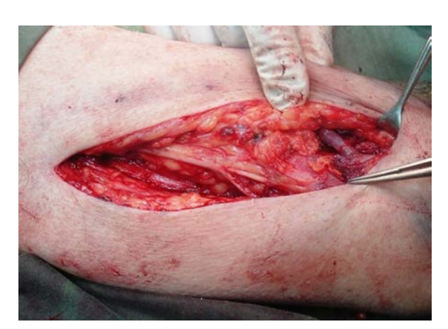
Figure (10): End-to-side BBAVF.

All patients were followed at 1, 3, 6, 9 & 12 months after operation. Following surgery, AVF were not used for at least one month allowing vein maturation and patients were reevaluated with Duplex examination, and the sites most suitable for needle insertion were marked on the skin. Early and late complications were recorded in both groups. A successful fistula was defined as a fistula that had been successfully needled for dialysis. The presence or absence of a thrill was not used to define technical success, because the simple presence of a thrill does not determine whether a fistula will mature to become usable or cannot be used for dialysis.<sup>20</sup> Primary patency was defined as the percentages of all AVFs attempted that were still being used for dialysis and not required any intervention to maintain or re-establish patency at one year.<sup>14</sup> Clinical criteria were used to detect thrombosis.