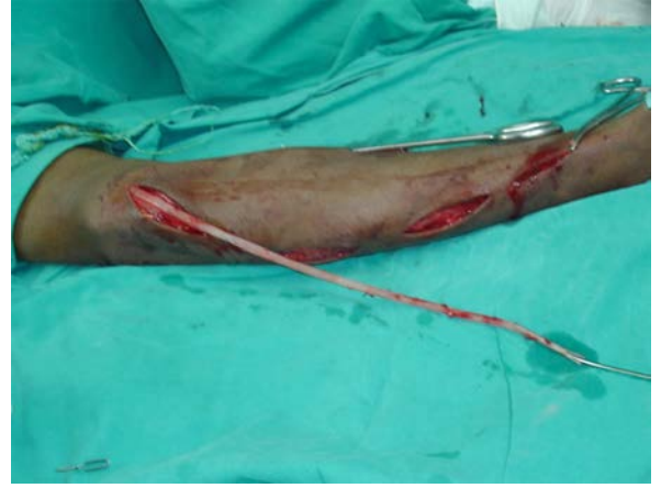
Figure (3): Dilatation of the basilic vein with saline.