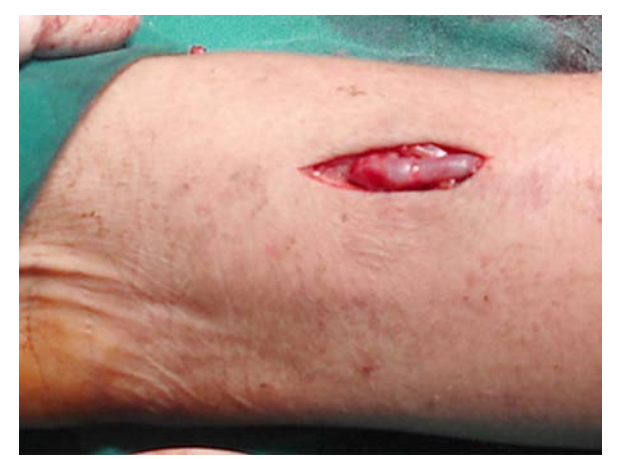
Figure (5): End- to-side RBAVF.