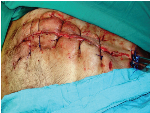
(a): During operation.