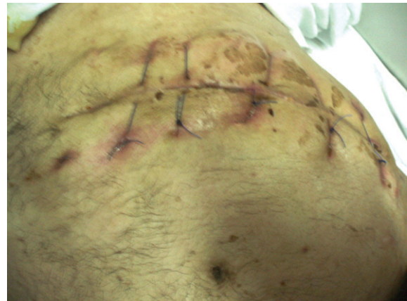
(b): After removal of tubes.