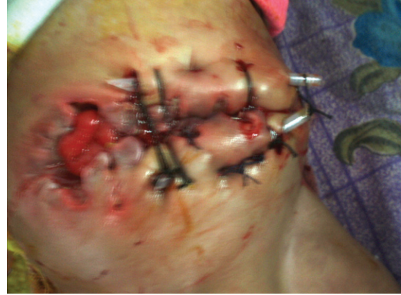
(b): After operation.