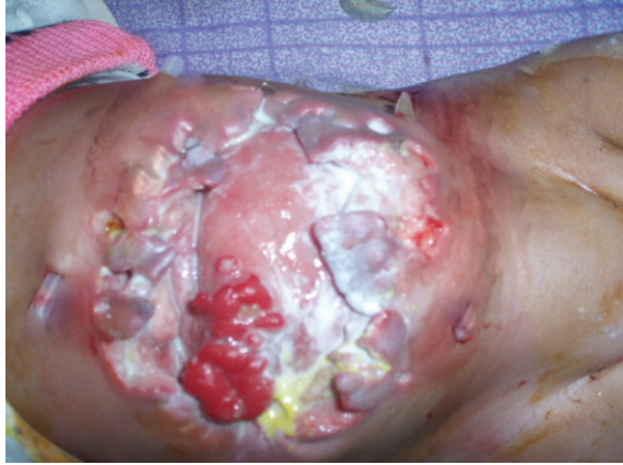
(a): During operation.