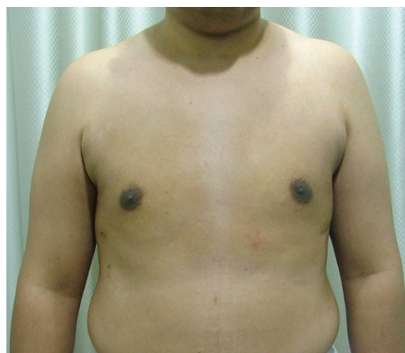
Figure (1): Preoperative and postoperative views of a 23 year's old male patient of group I.