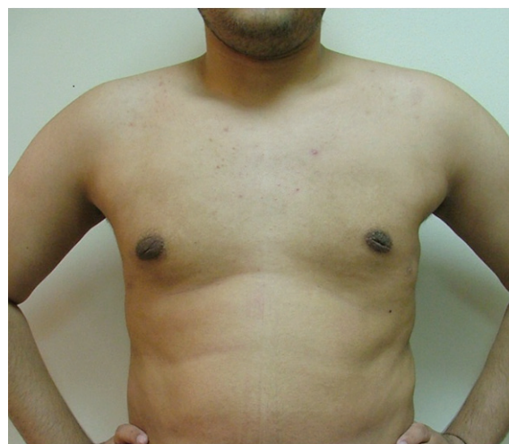
Figure (2): Preoperative and postoperative views of a 21year's old male patient of group II.