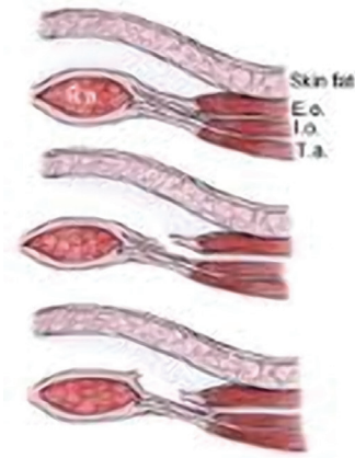
Figure (1): Diagram shows component separation technique.