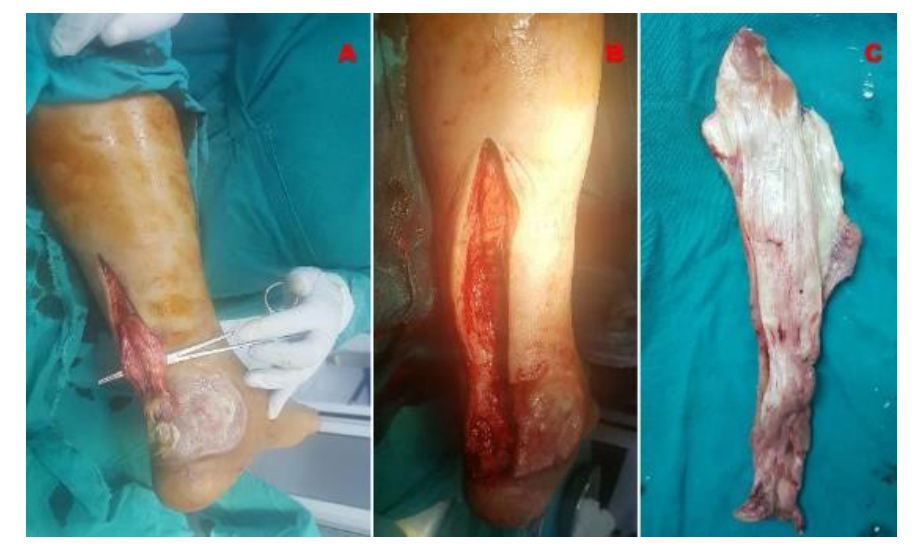
Fig 1: Intraoperative images for exploration, dissection of the tendon (A) and its total excision (B, C).

It included radical debridement of necrotic and infected tissue till reaching healthy edges then resection of the necrotic Achilles tendon [complete in group A (Figures 1,2) and partial in group B.