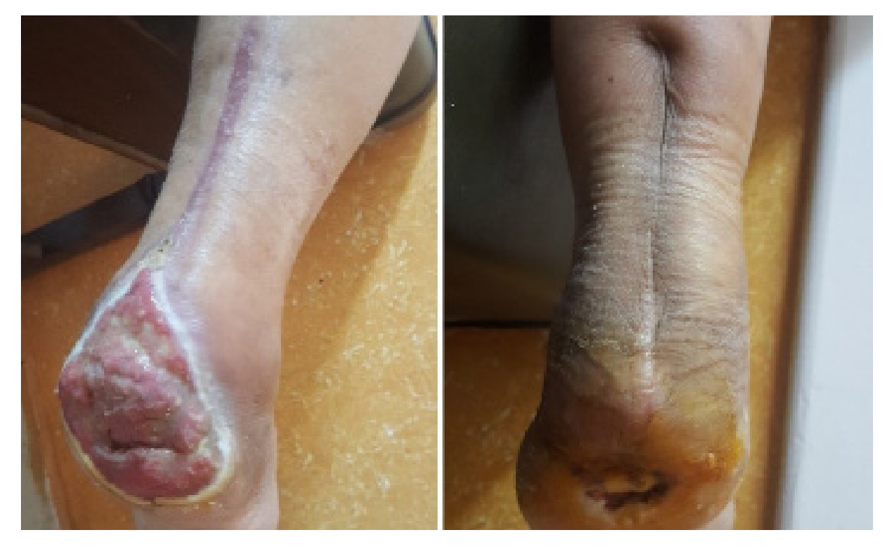
Fig 6: Postoperative images showing resistant ulcers and incomplete healing after total tendon excision.

Repeated debridement was needed in some cases (10 patients, 28.57%) to eradicate infection and to remove residual devitalized tissue. A second debridement was enough to control infection in