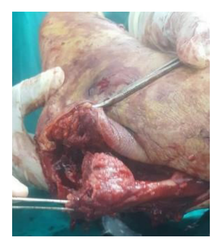
Fig 3: Intraoperative image showing partial clacenectomy and total tendon excision.

Decision to completely excise Achilles tendon was made when extensive infection and necrosis involved the entire tendon, its paratenon and the soft tissue around it. Partial calcanectomy alongside with total tendon excision was needed in some cases that showed evidence of calcaneal osteomyelitis (Figure 3). However, mild tendon infection, intact paratenon and favorable local soft tissue conditions to cover exposed tendon would justify partial tendon excision and preservation of remaining intact tendon and its sheath.