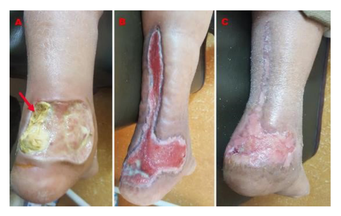
Fig 5: Preoperative image of chronic lower leg ulcer with exposed necrotic Achilles tendon (arrow) (A) and postoperative images showing wound healing 2 months after complete tendon excision (B) and complete healing after 4 months (C).