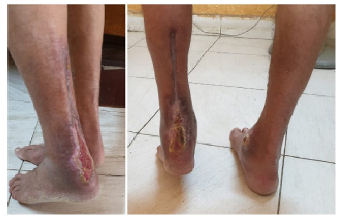
Fig 7: Positive heel-rise test.

Additionally, subjective methods including activity limitation, walking ability on different surfaces and gait abnormalities were also used to assess functional outcome post-operatively. Generally, partial tendon excision was linked to better functional outcome data in all three parameters used (Activity limitation, walking surface difficulty and gait abnormality), yet no statistically significant difference could be detected according to numbers available (Table 5) .