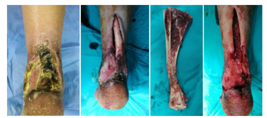
Fig 2: Intraoperative images for infected necrotic Achilles tendon (A), dissection of the tendon (B) and its total excision (C, D).